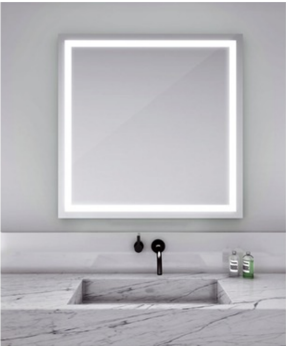
Shown in: Mirror

The Integrity Square Lighted Mirror is designed to maximize direct illumination. Ideal for precision tasks such as makeup application and shaving. White powder coated chasis for finished side view. Corrosion resistant DuraMirror glass. Available in two sizes. Choice of standard control or with AVA dimming. Ava Smart Look technology features tunable white LED lights that allow you to select the color temperature. Select between 6500K for a day of outdoor activities, 4600K for your daily routine, or 2700K for a night out on the town. Tap to Cycle through 2700K, 4600K, 6500K, Night Glow and Off. At every level, hold to dim down to 10%. After one hour of non-use, Energy Save Mode automatically dims lights to 10%. UL and cUL listed for damp locations. ADA compliant.