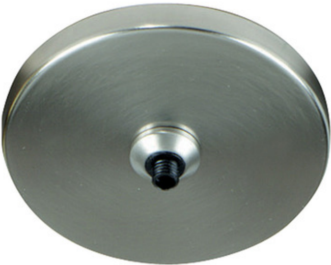
Shown in: Satin Nickel

The 4 Inch Round Flush Freejack Canopy is designed for use with Tech Lighting Freejack pendants. It mounts to a standard 4 inch junction box with a round plaster ring (not included). Note: A transformer is required, sold separately.