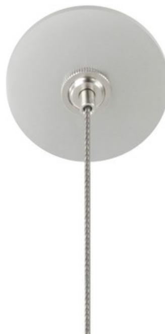
Shown in: Satin Aluminum

The Cirrus Suspension 2 Inch Round Canopy with Junction Box includes a special plaster ring that fits on a 4 inch square or octagon junction box. Optional to the 4 inch square canopy which is included as the standard canopy option on all Cirrus Suspension fixtures. Finish available in Satin Nickel, Chrome, Antique Bronze, Satin Aluminum, White or Satin Black. 2.8 inch diameter.