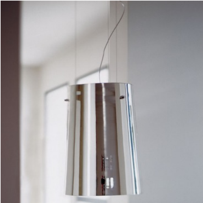
Shown in: Chrome / Mirror

DESCRIPTION Sera S1 suspension features a blown glass diffuser in a slightly flared shape, suspended by three wires from an arrow v-angled flat canopy. Cable artfully curves downward from its own separate canopy. Shade available in Clear Crystal, Opal White, or Mirror finished in Chrome, in three sizes. One 150 Watt 120 Volt A21 type medium base bulb is required, but not included. General light distribution. Dimmable. Designed by Mengotti. Made in Italy. UL and CUL listed.