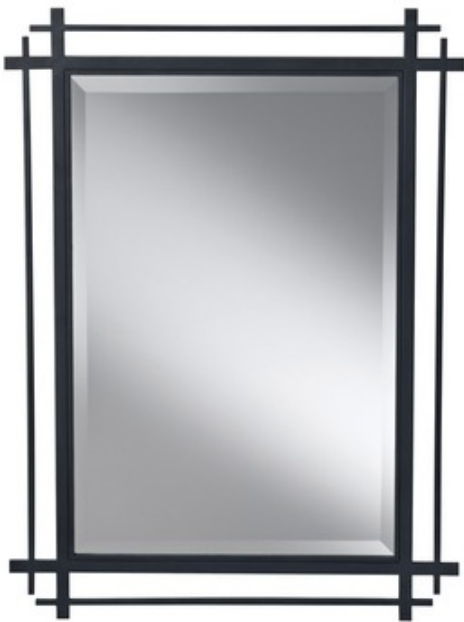
Shown in: Antique Forged Iron / Mirror

The Ethan Mirror has a contemporary style that focuses on the strong vertical and horizontal lines. The style is versatile and will enhance a wide variety of decors. Add this mirror to a hallway or room to give the illusion of additional depth. Features an Antique Forged Iron finish. Can be hung vertically or horizontally.