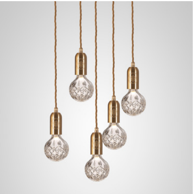
Shown in: Brass / Clear

Crystal Clear Chandelier is available in a Polished Chrome or Brass finish and features three five Clear Bulbs suspended at set lengths from a satin white ceiling plate and creates a dramatic cluster that is simple to install. Taking inspiration from the delicate craftsmanship of crystal cutting, Crystal Bulb combines industrial influences with decorative qualities, transforming the everyday light bulb into a beautiful ornamental light fitting. Each lead Crystal Bulb is handcrafted using traditional techniques and hand cut with a classic crystal pattern inspired by those found on traditional whiskey glasses and decanters. Available with three or five pendants. CE and cUL listed.