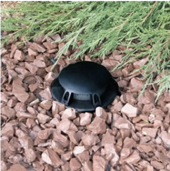
Shown in: Black / Clear

DWCL2 Composite Mini Beacon Fixture is constructed from a single piece compression molded fiberglass reinforced polyester composite material that is textured, pressure formed and molded-in-color in Black. Ribbed clear acrylic optical assembly. Prewired with 3 foot pigtail of 18-2 AWG wire. Low voltage quick connector LVC3 included for easy hook up to the low voltage supply cable not included. One 20 watt T3 bipin halogen lamp included. Lower wattage lamps are acceptable. 5.3 inch diameter x 7.4 inch overall high. Requires remote transformer not included. ETL listed for wet locations.