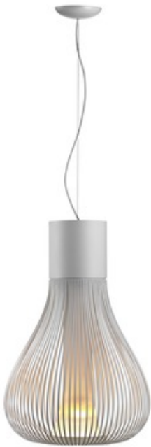
Shown in: White / White

Chasen S2 suspension provides lighting through its Black photo etched body and borosilicate diffuser by means of a mechanical movement that opens the louvers as it varies the shape of the luminaire. One 120 watt, 120 volt, PAR38, Medium based Halogen bulb is required, but not included. 19 inch width x 33.4 inch height x 177.4 inch overall length.