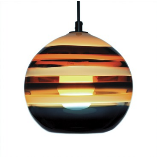
Shown in: Dark Bronze / Amber

The Banded Orb Pendant is a striking piece that draw inspiration from the rich hues and undulating topography of Southern California. Alternating layers of opaque and transparent colors are applied to clear glass. Overlapping to create new colors, which adds to the depth of the pieces. The intense color is complemented by its simple shape. Made in California and signed by Caleb and Carmen. Note: Each piece is hand blown and shaped in lead free crystal. No molds are used, and each glass shape is unique. Dimensions, weights, and color will vary slightly.