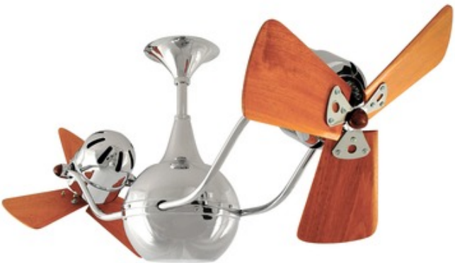
Shown in: Chrome / Mahogany

The Matthews-Gerbar Vent Bettina Wood Ceiling Fan brings fluid lines, gently curving arms and quiet rotation to your space. The fan heads can be infinitely positioned in 180 degree arcs for optimum air movement. The greater the angles of the motors to the horizontal support rods, up or down, the faster the axial rotation. A slow, controlled axial rotation is achieved by both fan head position and fan blade speed. The 360 degree rotation can circulate heat and and air condition more effectively that traditional fans. Available in a variety of finishes with solid, ecologically harvested Brazilian Mahogany blades. Features a 19 degree blade pitch and 16 inch diameter per head. Includes a flat ceiling canopy, one 10 inch downrod, and a 3 speed Decora-style wall control in White. UL and cUL listed. Limited lifetime warranty. Additional downrod lengths and vaulted ceiling canopy sold separately.