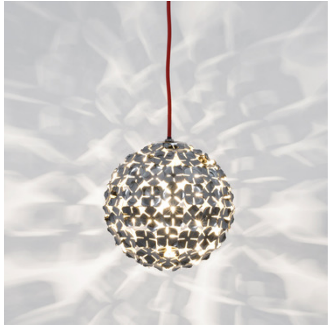
Shown in: Nickel

The Orten'zia Pendant features hand soldered petals forming a bouquet of light radiating glimmering light and shadow when lit. Available in Nickel finish with a red cord or Gold plated finish with a black cord. ETL listed.