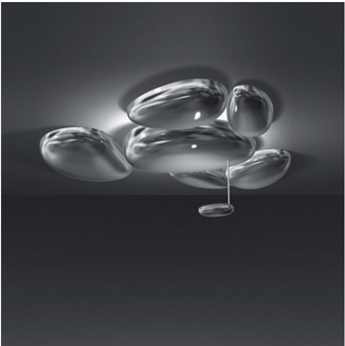
Shown in: Polished Chrome

The Skydro Electrified Ceiling Light is made from ABS injection-molded reflective die-cast aluminum with a painted steel bearing structure. Due to the modularity of the system, it is possible to obtain a number of configurations simply by adding extra units. Integrated 29 watt 120 volt LED light source. Dimmable via 2-wire dimming.