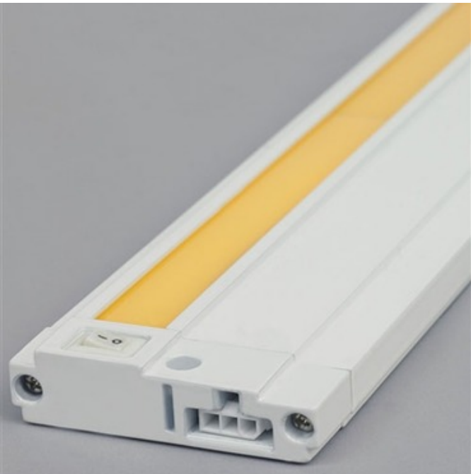
Shown in: White

The Unilume Slimline 90CRI Undercabinet Light utilizes the tight clustered blue LEDs, a 98 percent reflective mixing chamber and an Internatix ChromaLit remote phosphor lens. The result is consistent illumination with ultra high efficiency-all in a housing that is less than 3/4 of an inch deep. Finish in Black or White. Available in four sizes. Available in choice of Very Warm White 2700K, Warm White 3000K, or Neutral White 3500K color temperature with 90CRI. 50,000 hour average lamp life. Features an integrated LED driver that makes installation easy and allows smooth dimming down to 15 percent using an electronic low voltage dimmer. Each unit includes an integrated on/off switch. ETL listed. Suitable for damp locations. Extra Small: Includes 4 watts LED, 240 lumens. 7.2 inch length x 2.8 inch depth x .7 inch height. Small: Includes 8.5 watts LED, 527 lumens. 13.2 inch length x 2.8 inch depth x .7 inch height. Medium: Includes 10.5 watts LED, 693 lumens. 19.2 inch length x 2.8 inch depth x .7 inch height. Large: Includes 18 watt LED, 1224 lumens. 31.3 inch length x 2.8 inch depth x .7 inch height. 5 year warranty. Title 24 compliant. ETL listed. Required and optional accessory items available, sold separately.