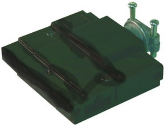
Shown in: Black

The Undercabinet Splice Box is required for hardwire applications. Conduit is fed into the back and jumper connector ports on each side can feed power to undercabinet light runs in two directions. The 1 inch jumper connector (sold separately) can be used to place the splice box next to the undercabinet housing. Longer jumper connectors can be used to place the splice box in a more convenient or remote location. Includes 3/8 inch conduit connector. Designed for use with Tech Lighting Unilume Slimline and Glyde undercabinet lights.