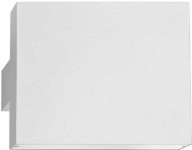
Shown in: White

Direct-indirect light wall lamp with body in painted White extruded aluminium. Diffusers in injection printed PMMA with photo-engraved finish. Multi-voltage power pack integrated in the body as well and can only be mounted on j-boxes using a universal mounting ring, not included. Integrated 18 watt 120 volt LED light souce. 6.29 inch width x 5.11 inch height x 3.93 inch depth. For indoor use only. UL listed. ADA Compliant. Non-dimmable.