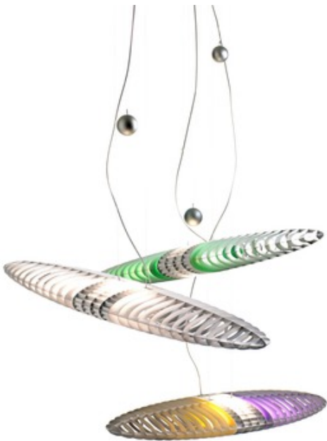
Shown in: Aluminum

The Titania Pendant features lamellar shell and lead counter weight in natural aluminum finish. Spherical counterweight for height adjustment may be inserted or removed at any time. Five pairs of interchangeable filters in yellow, light blue, violet and pink are included. The filters determine the different colorings of the lamellar shell, while continuing to emit a white light.