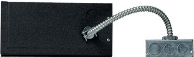
Shown in: Black

This 300 watt 12 volt remote magnetic transformer converts standard 120 or 277 volt line voltage to 12 volts, providing the necessary voltage for powering a Tech Lighting low voltage lighting system. Can be used to power lamps totaling up to 300 watts. This transformer is equipped with fast-acting short circuit and overload protection that will safely turn off the system should a short occur. Once the short is removed, the unit can be reset. Must be installed in a remote, but accessible location such as above the ceiling or a closet, and should be located no more than 20 feet from the required single feed power feed, sold separately. ETL listed.