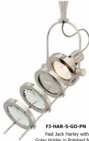
FJ-HAR-5-GO-PN Fast Jack Harley with Gobo Holder in Polished Nickel