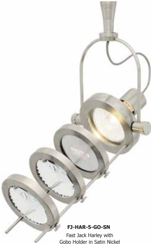
FJ-HAR-5-GO-SN Fast Jack Harley with Gobo Holder in Satin Nickel