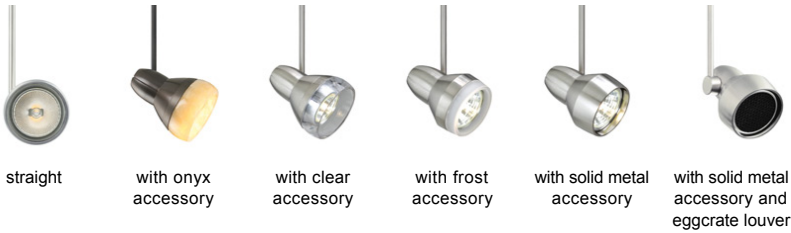
straight with onyx accessory with clear accessory with frost accessory with solid metal accessory with solid metal accessory and eggcrate louver