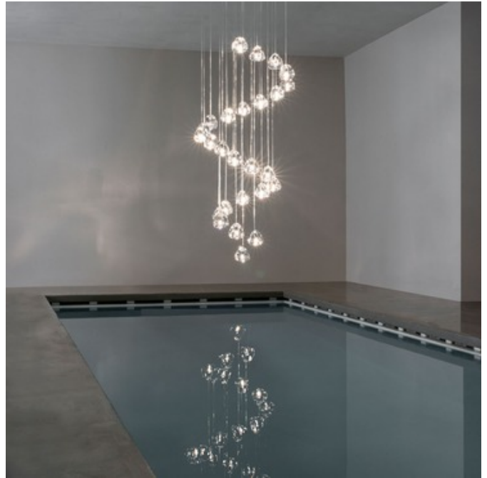
Shown in: White / Clear

The Mizu Round Multi Light Pendant is hand-made and inspired by tranquil and mesmerizing light refractions created by water. Like water droplets, no two Mizu fixtures are alike. Each crystal shape is unique. Made from 24 percent lead, the clearest crystal perfectly emulating water's refraction of light. Available with 3, 7, 15 or 26 pendants. Note: Not all options available.