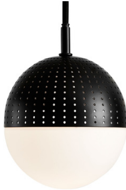
Shown in: Black / Opal

The Dot Pendant offers a cozy atmosphere with a Scandinavian design. It features a perforated metal half sphere on top with an glass diffuser on bottom. Includes canopy in matching finish.