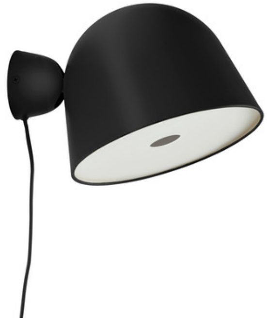
Shown in: Black

The Kuppi Plug-In Wall Sconce is formed by two difference sized cups to create a minimalist silhouette. It features a metal body and a White acrylic diffuser. On/Off switch on cord.