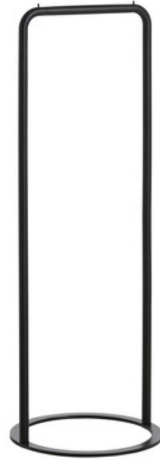
Shown in: Black

When paired together, the small rack can nestle within the larger rack for a multi-level configuration with a minimal footprint.