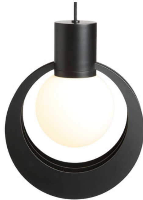
Shown in: Black / Opal

The Lunar Pendant evokes images of the moon in the night sky with its opal glass globe shade set within a sleek black metal frame. As the pendant is viewed from different angles, the tilted rings partially obscure the globe to mimic the appearance of a waxing or waning moon.