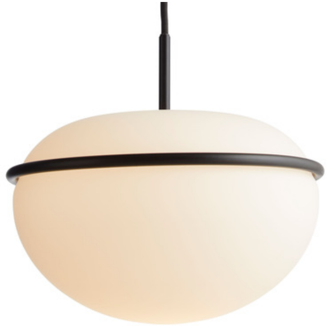
Shown in: Black / Opal

The Pump Pendant was inspired by the shape of a hot air balloon for a light, airy aesthetic that will elevate any interior. The opal glass shade is surrounded by a black, tubular steel ring which provides contrast and causes the pendant to appear to float in mid-air.